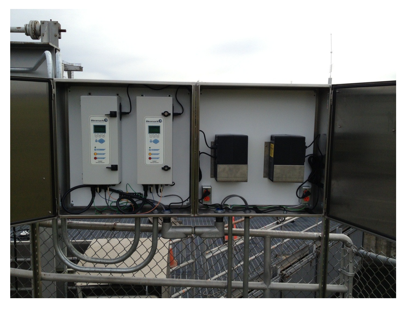
PIT tag stationary readers at TD2

The future for thin body antennas is bright. Future U.S. Army Corps of Engineers (USACE) projects include antennas for the Little Goose adult ladder, both adult ladders at Lower Monumental and a single antenna at the Ice Harbor adult fish trap. The single antenna at Ice Harbor will provide for a separation-by-code system to target specific fish for trapping and transport. Other possible projects being discussed are both adult ladders at John Day.