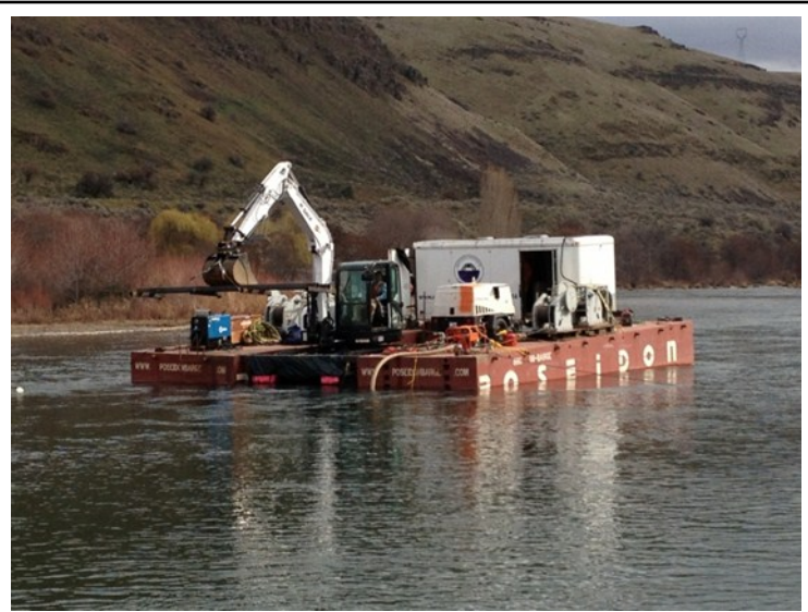
The work platform in the Deschutes River with Biomark 20' stout antenna secured to the excavator shovel ready for submersion and placement.

The Confederated Tribes of Warm Springs (CTWS), with funding from the Bonneville Power Administration, installed a PIT-tag detection system near the confluence of the Deschutes and Columbia rivers. The system began interrogating on 14 March, 2013. The antenna array is expected to be a very useful tool for determining straying rates of adult steelhead Oncorhynchus mykiss and fall Chinook O. tshawytscha returning to spawn, timing and number of migrating bull trout Salvelinus confluentus and sockeye O. nerka from/to the middle Deschutes River, and it may allow an alternative method or means to validate abundance estimates of Pacific lamprey Entosphenus tridentatus.