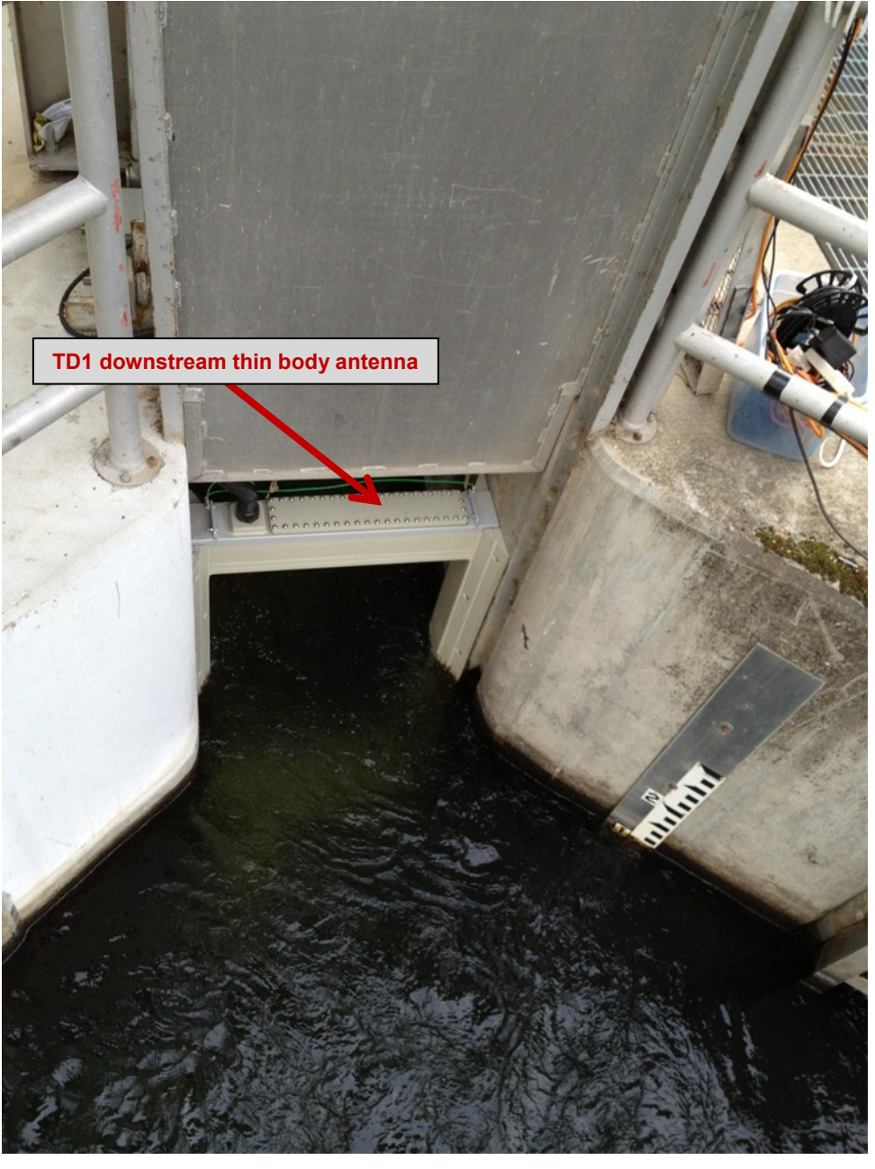
TD1 downstream thin body antenna

The Dalles adult ladders are now equipped with thin body ferrite tile PIT tag antennas. The goal of these antennas is a detection rate of near 100% and an uptime of near 100%. The first detections at the dam have resulted in each antenna reading each tag 10+ times, which is an indication of a very robust detection system. The antenna systems were operational prior to water up at each ladder with the east ladder watering up on 2/12/2013 and the north ladder watering up on 3/11/2013.