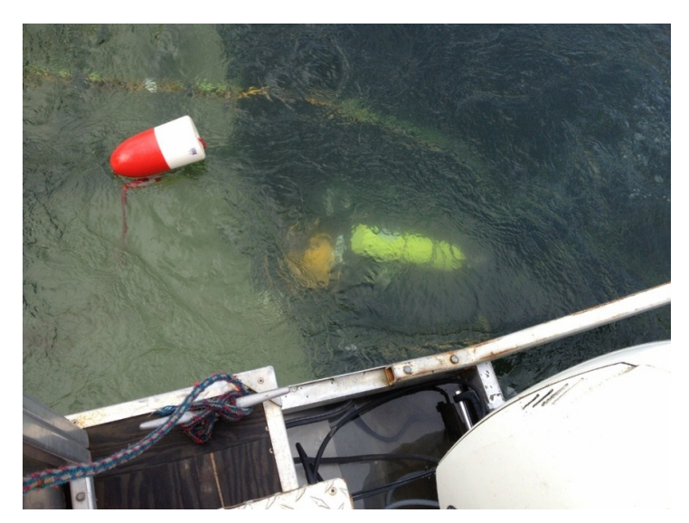
A diver places anchors to secure an antenna at the mouth of the Deschutes River.

Construction divers secured the 20' antennas to the substrate, basalt shelf and trenches, using a combination of wedge and duckbill anchors. Cable lengths were adjusted to accommodate ridges of basalt that run in an upstream-downstream orientation within the channel.